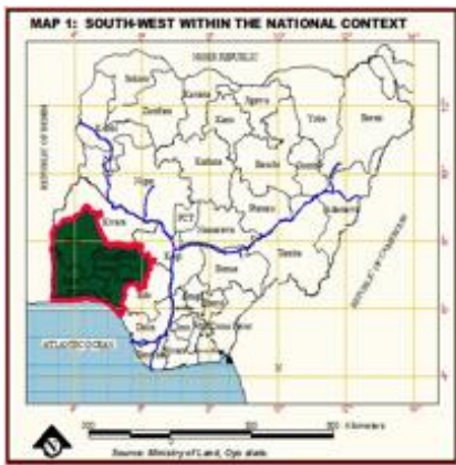
Figure 1.1: Study Area.